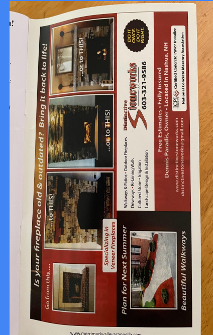
Inside Rear Cover